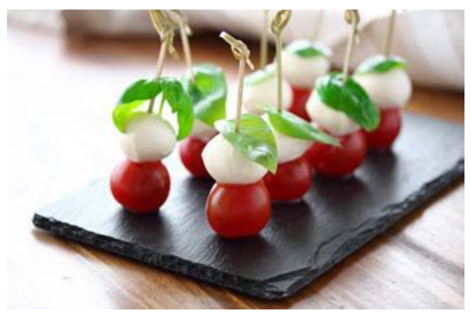
Mini Caprese Skewers