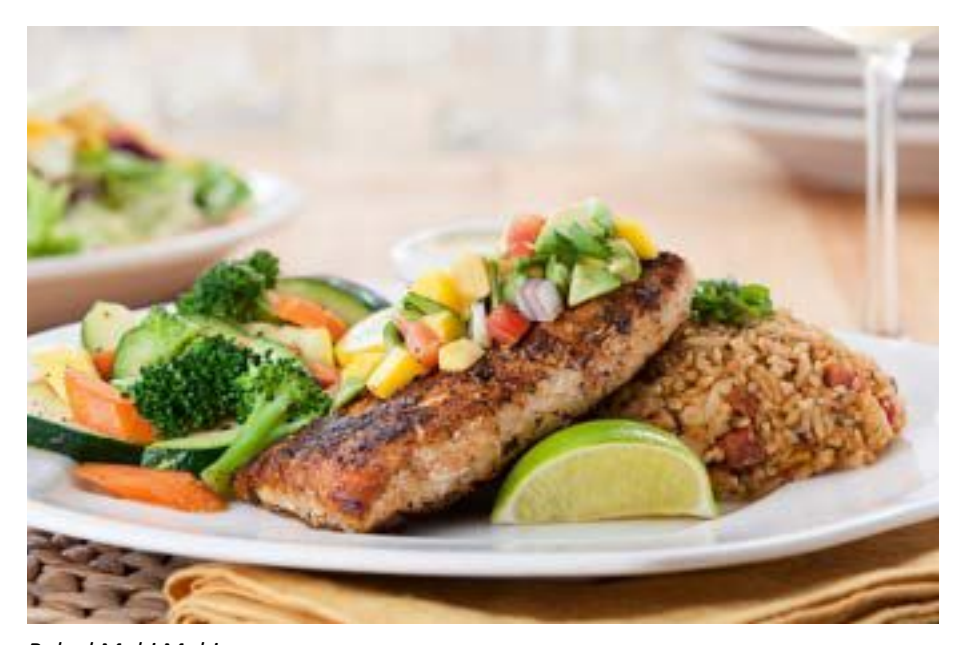
Baked Mahi Mahi