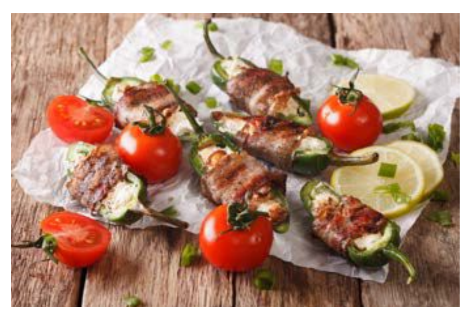
Bacon Wrapped Jalapeno

Seared Shaved Beef Crostini Served medium rare with horseradish cream and Parmesan cheese