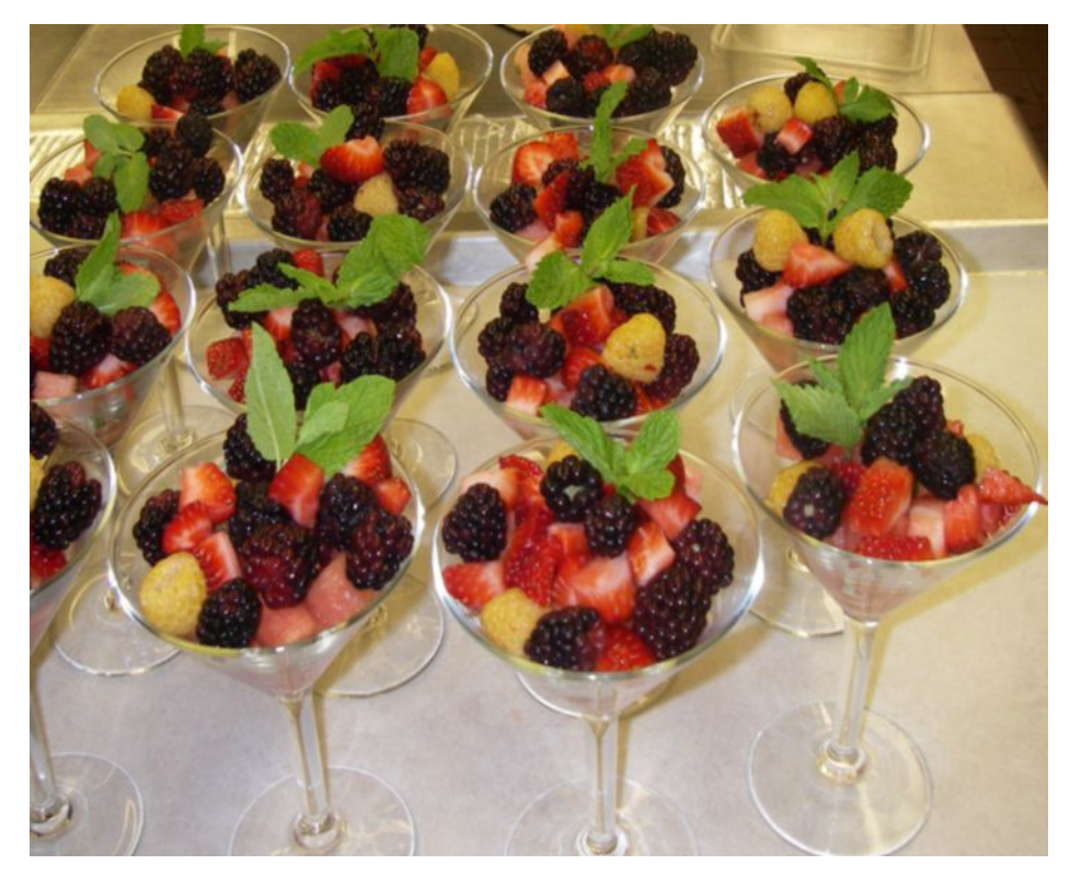
Seasonal Marinated Fruit

N.Y. Style Cheese Cake with a Fresh Berry Puree-Salted Caramel Brownie with Whipped Cream-Carrot Cake with a Cream Cheese Frosting-Chocolate Layer Cake with Chocolate Ganache-Classic Tiramisu with Espresso Sauce-Seasonal Marinated Fruit-