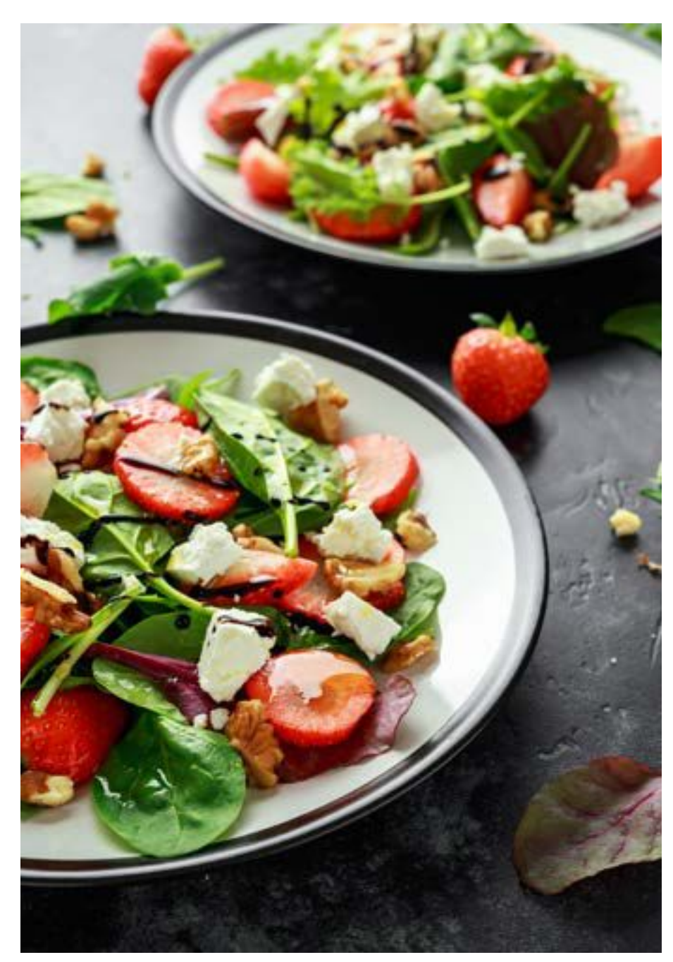
Spinach-Strawberry Spinach Salad